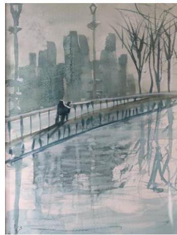
Gary Barker: 'The Dysecer Building', mixed media