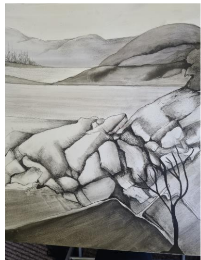
Louise Elcoate: 'By the Water', charcoal, ink, pencil