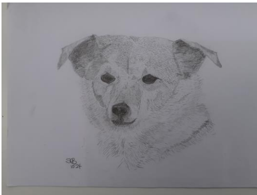
Shirley Bradshaw: 'My old Dog', pencils