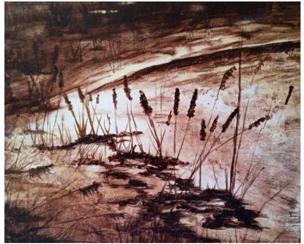
David Allen: 'Seen dimly at Sunset', acrylic & pen