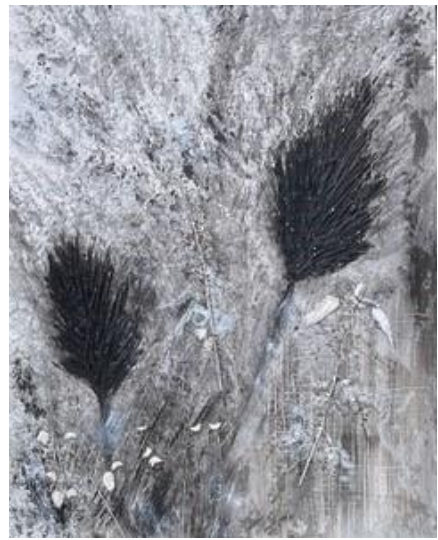
Penelope Hellyer: 'Softness in the Rough', mixed media