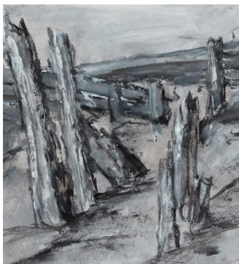
Lavinia Allison: 'The Groyne's', charcoal, gesso, pastel, acrylic