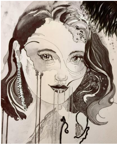
Bridget Vaughan: 'Summer', w/colour, pen, acrylic ink