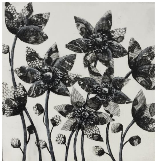
Stella Mance: 'Lace Flowers', mixed media