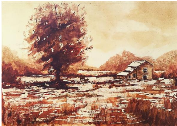
Dorothy Worrall: 'Winter Barn' w/colour, coffee, ink