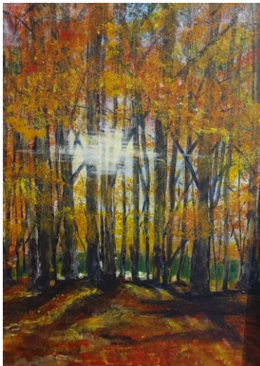
Dorothy Worrall: 'Autumn's Glow', Acrylic