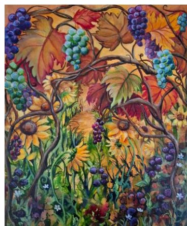
Stella Mance: "Autumn Harvest", Acrylic