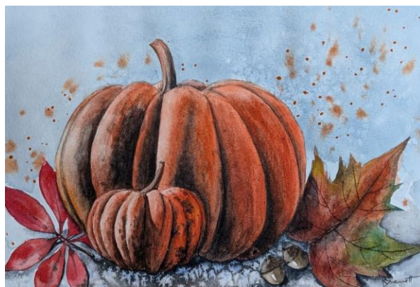
Kerry Bennett: 'Pumpkins', Watercolour