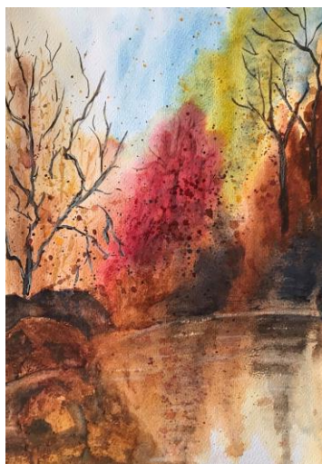
Mickie Sutcliffe: 'Bright Autumn' Watercolour