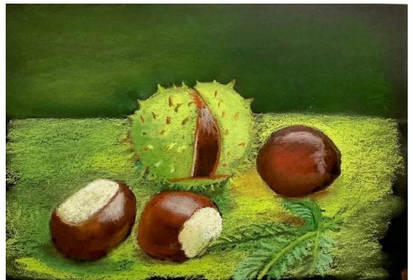
Evelyn Gray: 'Conkers', Soft Pastels