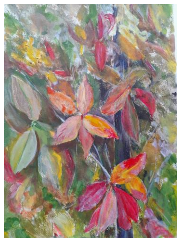
Jana White: 'November Walk', Acrylic Inks