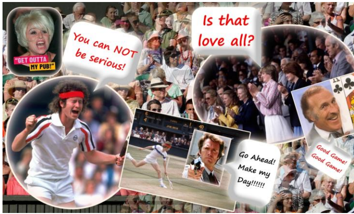
Richard Potts: 'Creating a Scene', digital collage