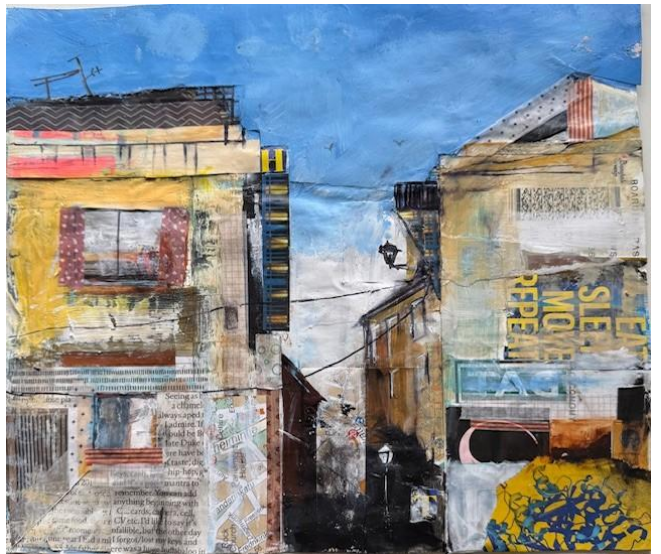
Juanita Gouws: 'Faded Facades', collage, acrylics