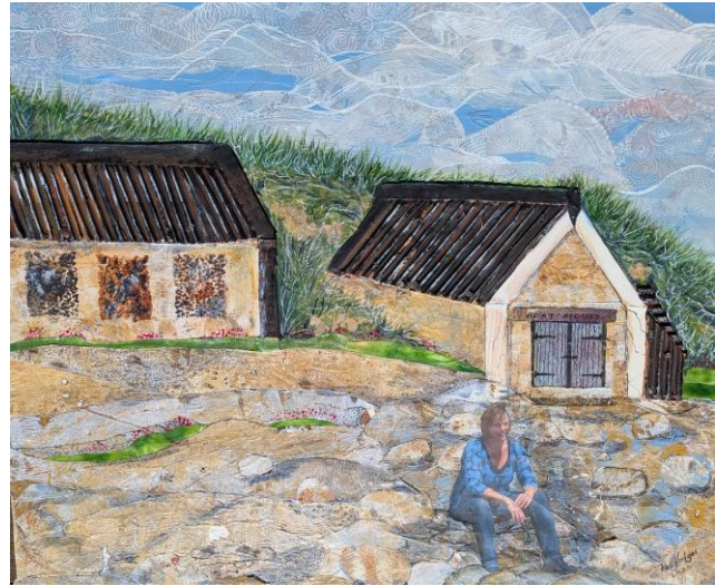
Ros Hodges: 'Lindisfarne Boat Shed', collage, acrylics & pens