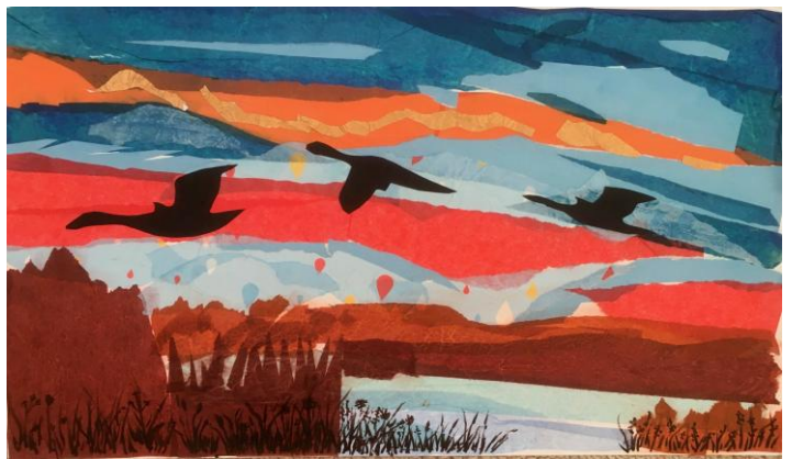
Evelyn Gray: 'Flying', collage