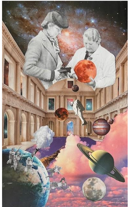
Claire Thompson: 'Universe Unboxed', collage