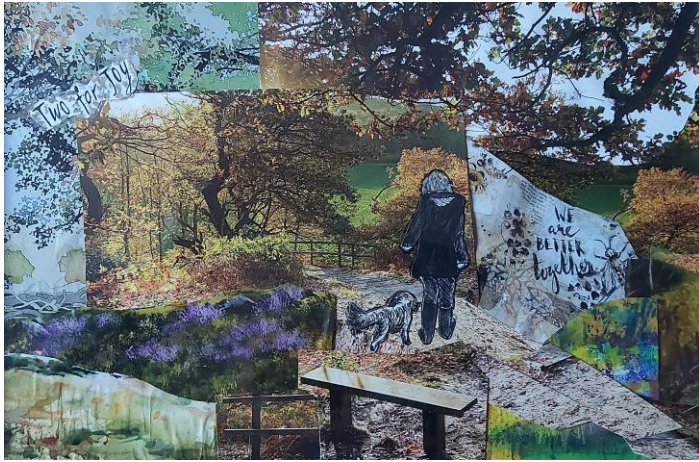
Dorothy Worrall: 'Together', collage, acrylics & ink pen