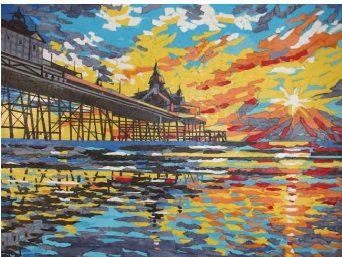
Dina Jones: 'Eastbourne Pier', collage