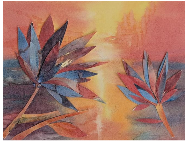
Kerry Bennett: 'Flowers in the Sun', collage, watercolour