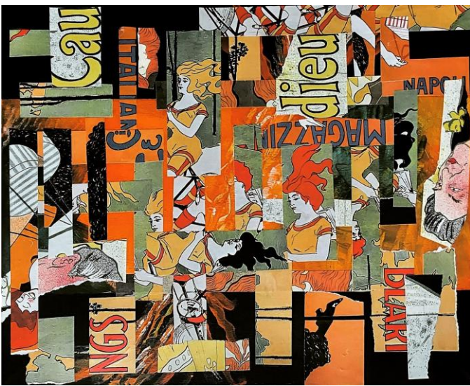
Brigitte Harper: 'Those were the Days', collage, acrylic