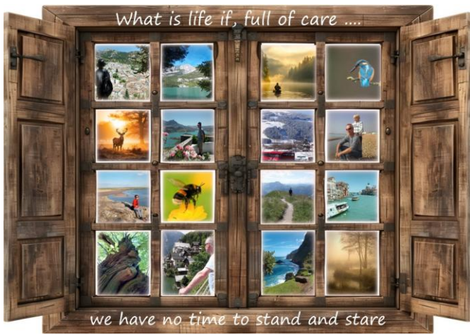
Julie Levett: 'Frame of Mind', digital collage