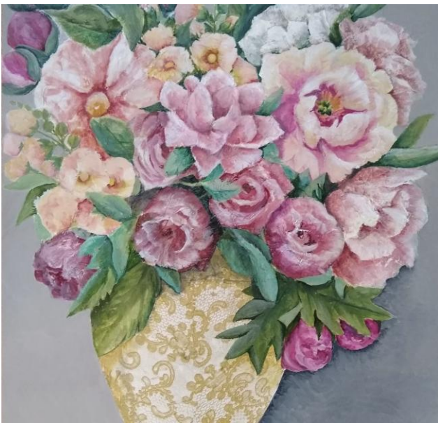
Stella Mance: 'Summer Bouquet', collage & ink