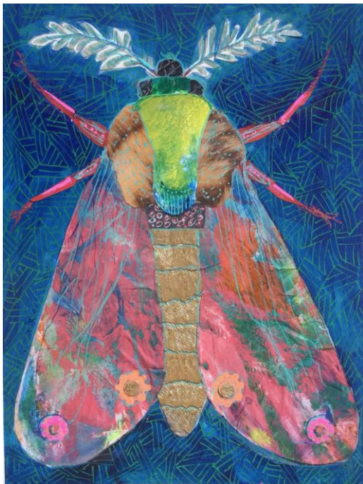
Elaine Baker: 'Glam Paper Moth', collage, mixed media