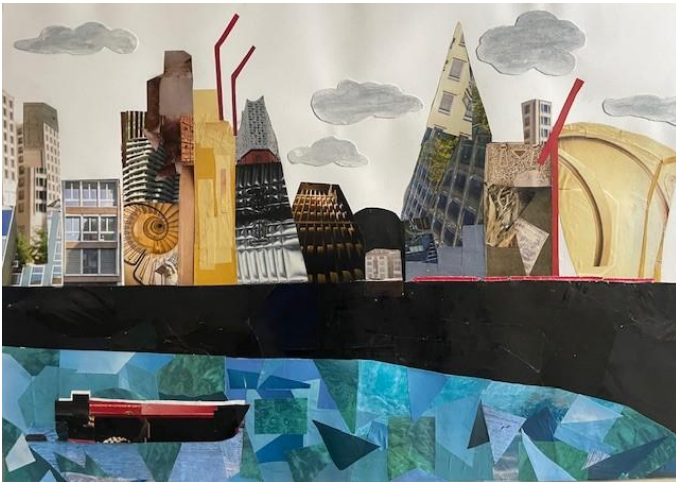
Angela Hart: 'London Skyline, collage