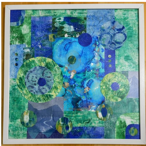
Sue Farrant: 'Bubbles', collage: