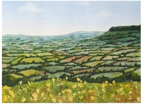
Kerry Bennett: Sussex. Watercolour