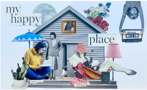
Melissa Hall: My Happy Place, collage