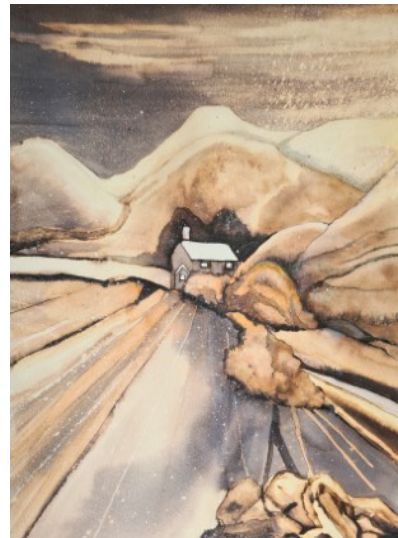
Louise Elcoate: Home away from Home, mixed media