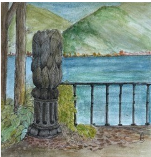
Penelope Hellyer: Lake Como, watercolour/ink