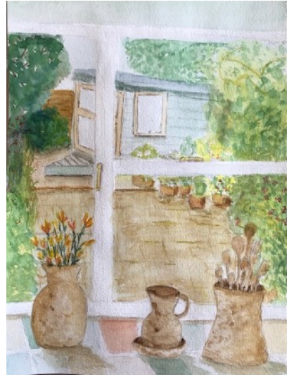
Mickie Sutcliffe: The Shed, watercolour