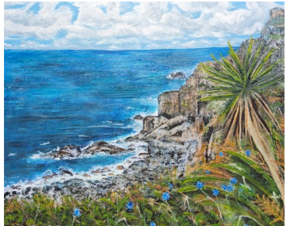
Ros Hodges: Northern Madeira, acrylic