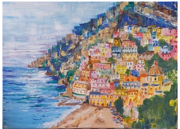
Dorothy Worrall: Positano, Amalfi coast, Italy: acrylic