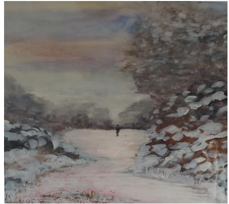
Dorothy Worrall: 'A Cool Walk', watercolour/acrylic