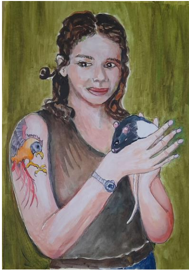
Adrienne Norbury: 'The Girl with the Bird Tattoo', acrylic