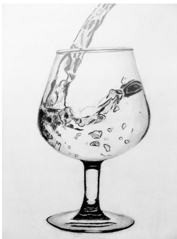
Evelyn Gray: 'Cool Drink', pencil