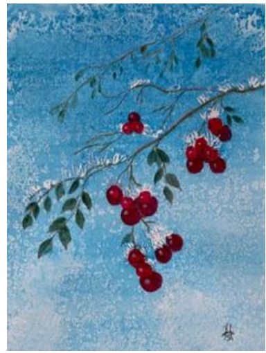
Penelope Hellyer: 'Cotoneaster Berries', acrylic