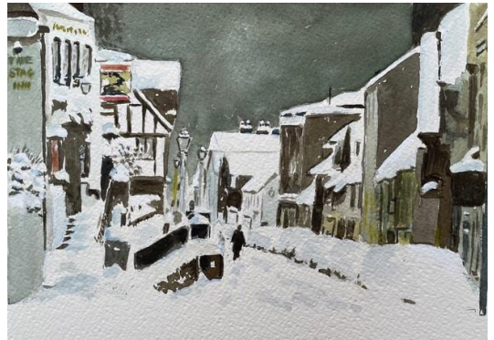
Robin Gray: 'All Saints Street', watercolour