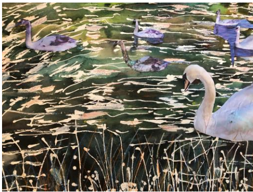
Sheila Martin: 'Cool Swans', mixed media