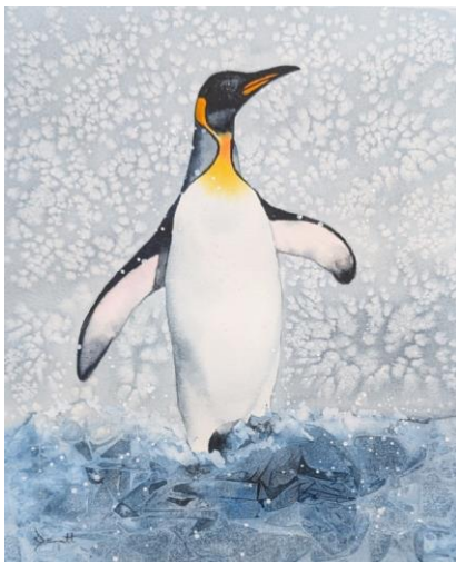
Kerry Bennett: 'King Penguin', watercolour