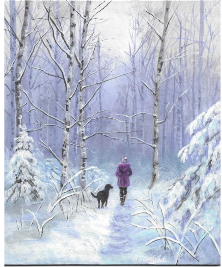
Bridget Vaughan: 'Winter Walkies', acrylic