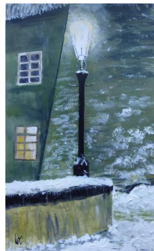
Jana White: 'Beauty of Wintertime', acrylic