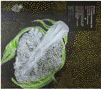
Ros Hodges: Colin the Cauliflower, acrylic on recycled Arts mag paper