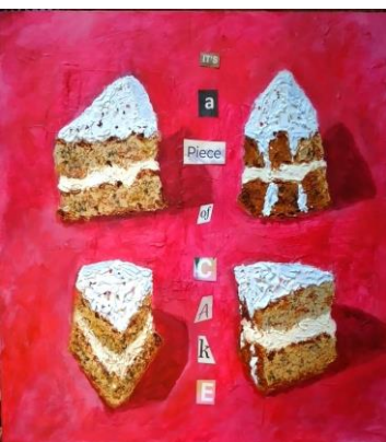
Lavinia Allison: It's a piece of cake, acrylic & oil