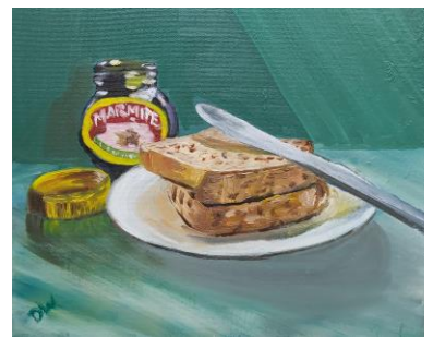
Dorothy Worrall: Breakfast, oil