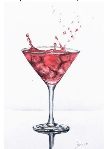
Kerry Bennett: Vampiro Cocktail, watercolour