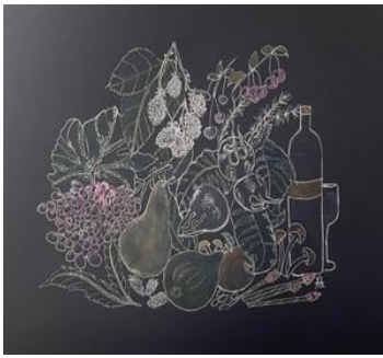
Penelope Hellyer: Food & Drink, mixed media