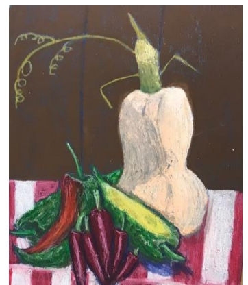
Mickie Sutcliffe: Homegrown Bounty, oil pastel