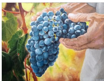
Julie Levett: Pinot Noir, acrylic