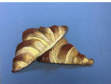
Evelyn Gray: Croissants, soft pastel