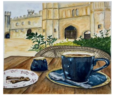
Rachel Lister: Taking Five, watercolour