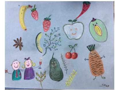
Stuart Robathan: Happy Fruits, pastel pencil