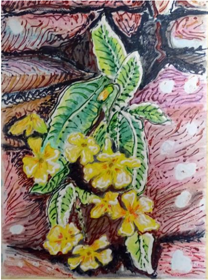
Adrienne Norbury: 'Off the Wall', acrylic