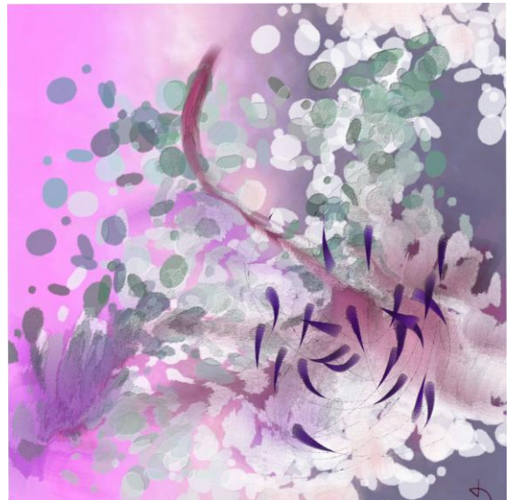
Bridget Harper: 'Spring Blossoms', digital