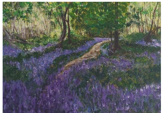
Dorothy Worrall: 'An Ode to Bluebells', acrylic