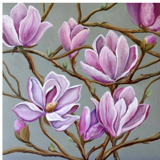
Stella Mance: 'Magnolia', acrylic