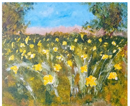
Sue Klein: 'Daffodils at Sedlescombe', acrylic