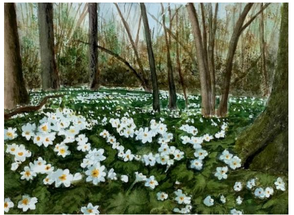
Robin Gray: 'Wood Anenomes' watercolour