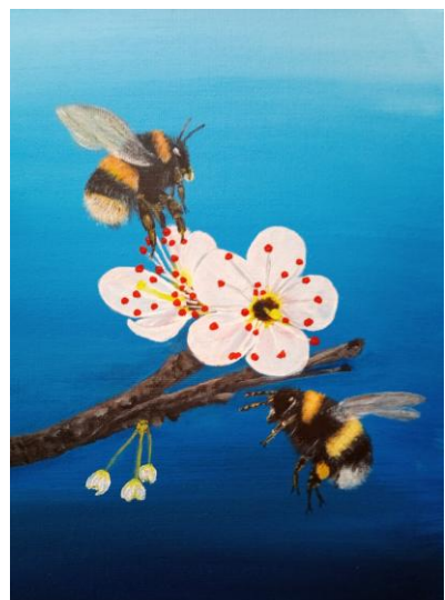
Julie Levett: 'Bumble Bees & Pear Blossom', acrylic