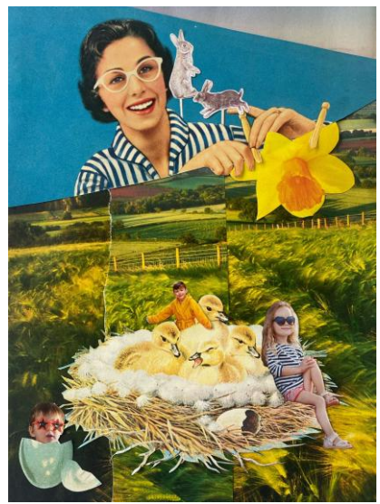
Melissa Hall: 'Spring', hand-cut paper collage