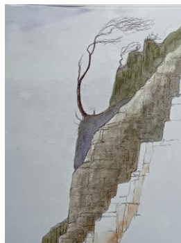
Mikki Staermose: Survivor, watercolour, ink