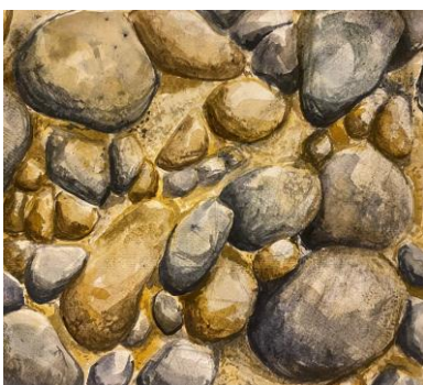
Melissa Hall: Pebbles on the Beach, watercolour