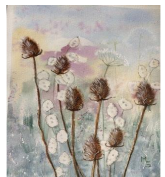
Mickie Sutcliffe: Honestly Wild, watercolour