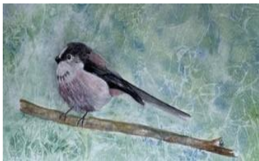
Penelope Hellyer: Lonely long-tailed Tit, watercolour