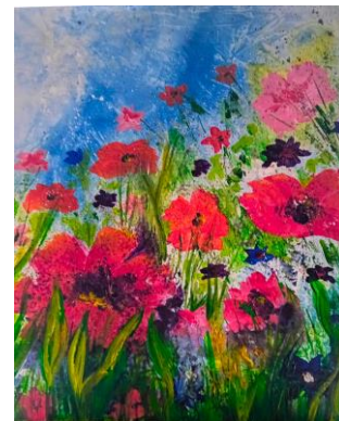
Sue Klein: Beautiful Poppies, acrylic