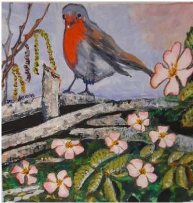
Adrienne Norbury: The Hedge, acrylic