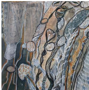
Ros Hodges: In the Shallows, acrylic