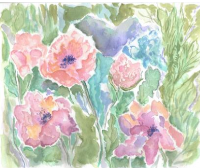
Lavinia Allison: Poppies, watercolour